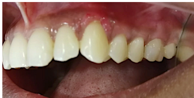
Figure 1: Upper left canine shows a "V" shaped gingival recession that is associated with ulceration, inflammation, and enlargement of the marginal gingiva.

On clinical examination, the labial gingiva of the upper left canine displayed a triangular shaped defect that was associated with an inflamed, enlarged, edematous and ulcerated marginal gingiva. Further minute observation of the marginal gingiva showed the presence of a fine apostrophe shaped cut or cleft, a sign that has historically been known as 'Stillman's Cleft' (Figures 1 & 2). The occlusal surfaces of the