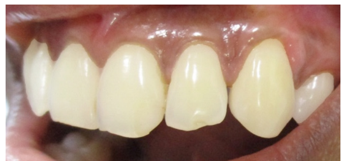
Figure 4: Post-operative image after six months, shows complete healing of gingiva with no signs of inflammation.

The patient was recalled again after 6 months for further follow-up to assess the procedure outcomes (Figure 4). The gingival tissue texture, color and