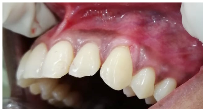
Figure 2: Pre-operative photograph of a typical presentation of Stillman's cleft, which shows clear resolution of the previously related inflammation.

premolars and molars showed generalized erosion and prominent wear facets related to attrition, which indicated the presence of a parafunctional habit such as bruxism or clenching that was not reported by the patient.