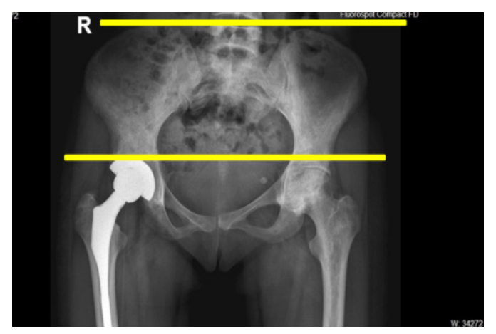
Figure 2: Second post-operative day: Anteroposterior digital x-ray image of patient's hip, the femoral stem with the fixed head articulates with the native acetabulum, neutral alignment with the longitudinal axis of the shaft, and corrected length discrepancy of < 1 cm

Pelvic x-ray images were taken on the second postoperative day and after six weeks, and was evaluated by the chief surgeon, no signs of implant loosening or early dislocation was observed (Figure 2). Harris hip score was used to assess the surgery outcome and a score of "excellent" (90 points) was observed.